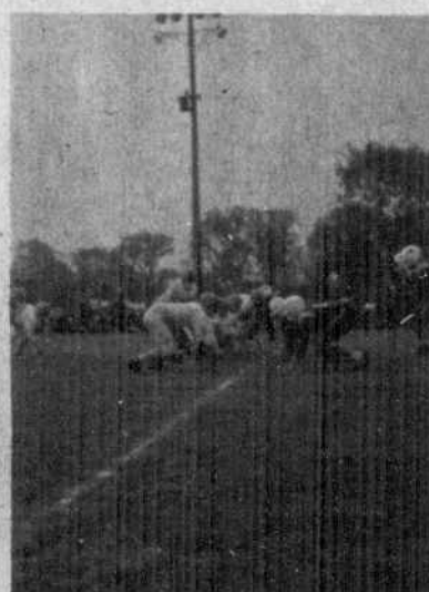
Stow (on left) and Hudson linemen get set for the next play during a recent scrimmage.

Before the game parents have been invited to the High School Gym. They will see equipment used by the players, medical facilities and demonstrations on such things as ankle taping.