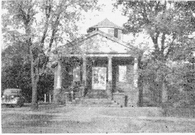
THE COMMUNITY CHURCH Elm Road Stow, Ohio